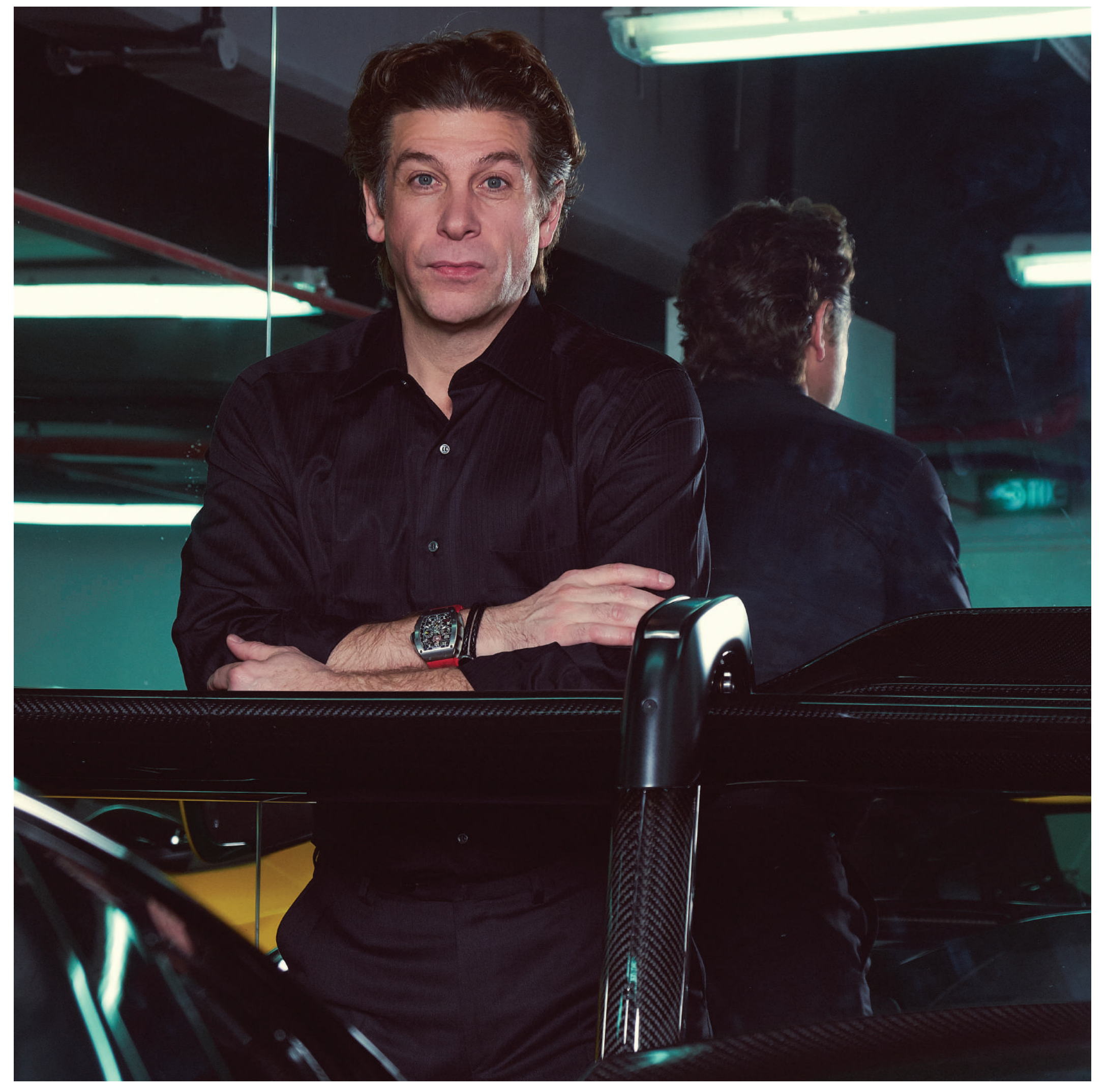
McLaren Senna - limited production super car - 1 of 500 units only.